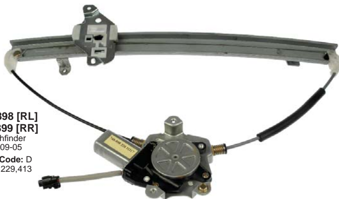
748-898 [RL] 748-899 [RR] Pathfinder 2009-05 Pop Code: D VIO: 229,413

Visit www.DormanProducts.com/GetMore for Product Information, Installation Sheets, Product Videos and More!