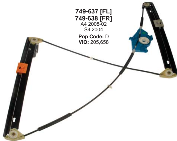
749-637 [FL] 749-638 [FR] A4 2008-02 S4 2004 Pop Code: D VIO: 205,658

MOST COMPREHENSIVE PROGRAM IN THE AFTERMARKET